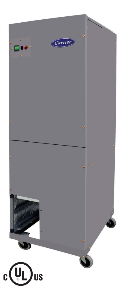
Fig. 1 – Carrier OptiClean<sup>TM</sup> Negative Air Machine

The Carrier OptiClean negative air machine is a portable, minimum 500 CFM solution primarily designed to help convert normal hospital rooms into Airborne Infectious Isolation (AII) rooms. Designed to ASHRAE's Standard 170 for Ventilation of Health Care Facilities, the Carrier OptiClean uses highly efficient filters and a heavy duty, yet quiet, motor to remove contaminated air from the room. The resulting negative air pressure, or "vacuum effect," helps limit the spread of air-based contaminants into surrounding areas. If negative pressure is not required, such as in an open-air, temporary hospital, the machine can be used as an air "scrubber," pulling air in, removing many contaminants, and discharging cleaner air back into the room.