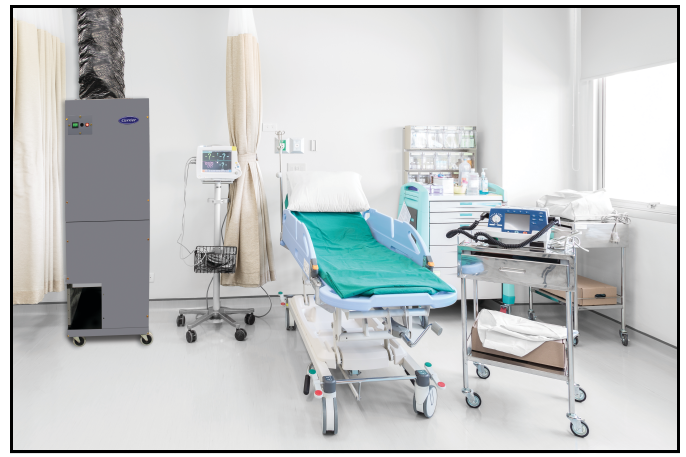
Fig. 2 - Room Setup Example